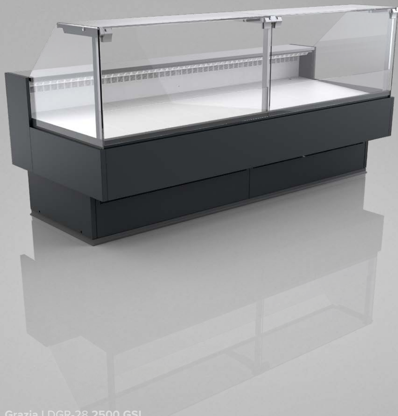
Grazia LDGR-28 2500 GSL

GSL – glass | single, straight | lift up