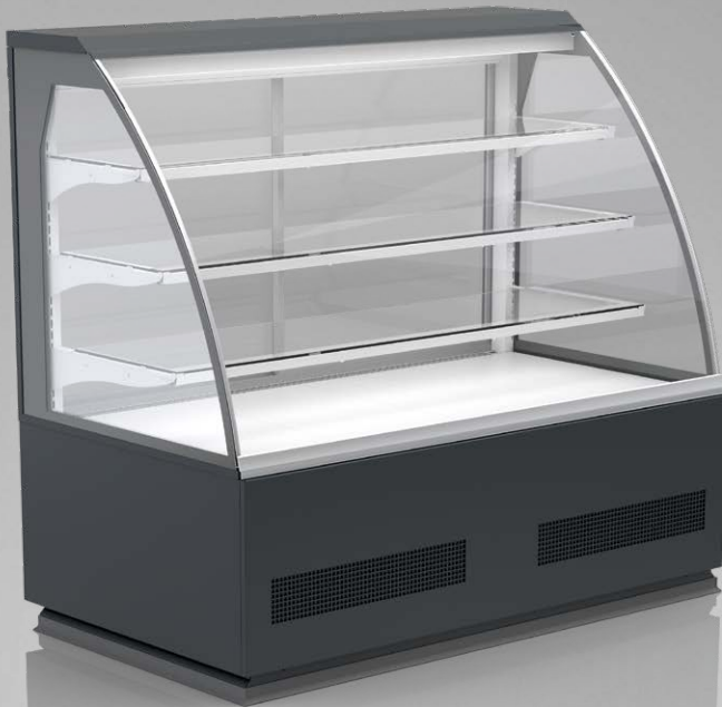
Elegant RDEL-05 1400 GBT