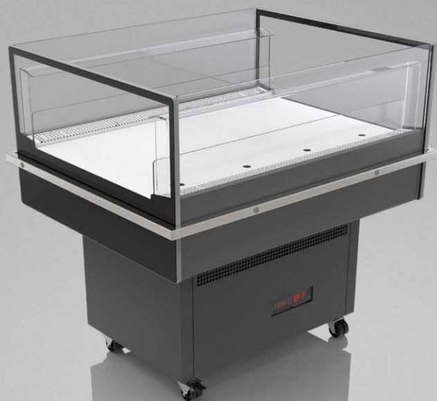
Fiji LDFI-13 0900 BSA

BSA — low glass or front glass riser | single, straight | fixed