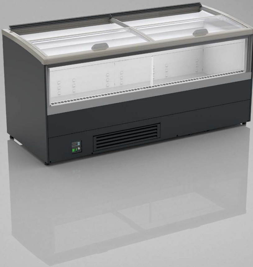
Imja WNIJ-07 2100 CCP

CCP – cover | single, curved | sliding (slide-up/push)