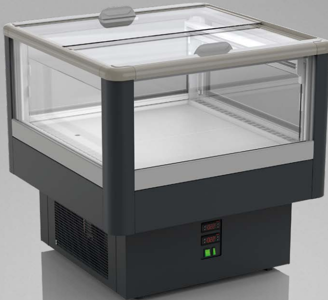
Pamir WNPA-09 0905 CSS

CSS — cover | single, straight | sliding (sideways)