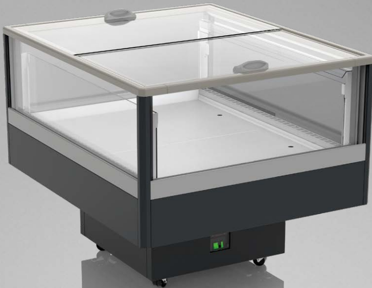
Pamir WNPA-15 1220 CSS

CSS — cover | single, straight | sliding (sideways)